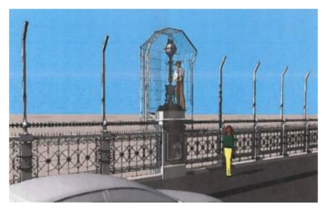
Schematic drawing showing the proposals prior to revision

6.3 The initial proposal was to increase the height of the original cast iron parapet by erecting a 2.54metre stainless steel catenary fence of stretched cables for the full width of the bridge above the parapet. The top of the proposed fence would be 4.54 metres above the pavement. This fence would be supported by 60x60 mm stainless steel stanchions clamped with steel straps off the original cast iron parapet piers. In order to enclose the central lamp standard above the centre pier a stainless steel welded mesh cage was proposed with the top of cage being 3.23 metres above the original parapet height. (Height above the pavement, 5.77 metres) The catenary fence of stretched cables would be fixed to the cage in order to fully enclose the centre pier.