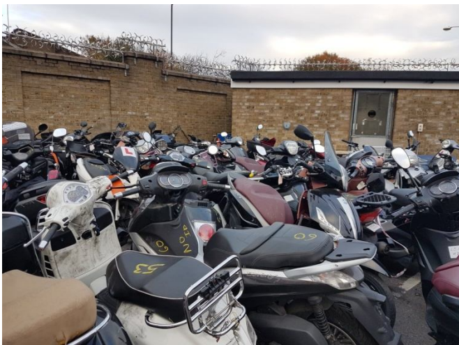
Just some of the stolen mopeds we have recovered.

It is widely believed that we cannot pursue, when in fact we can and do. Yes, there are restrictions and officers must be properly trained in pursuit tactics but the pursuit policy is clear. Where there is sufficient justification