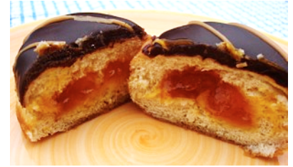
The fabled Jaffa Cake doughnut

Things are improving in Archway. Years after Emily's Home shop closed down the site has partially reopened with a branch of Greggs, the Newcastle family bakers that is now a much-loved nationwide chain. Jaffa Cake doughnut, anyone? There is, however, an application afoot to turn the other half of the building into yet