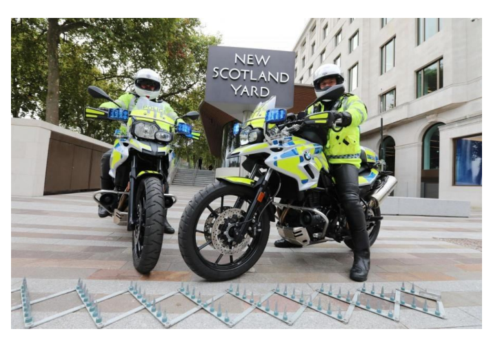
Our Op Attrition team is a dedicated team to bringing moped criminals to justice.

Many of our residents are understandably concerned and frightened by these brazen moped enabled criminals. The thieves conceal their identities with balaclavas and full face helmets, wear generic clothing and ride stolen mopeds. They do not fear CCTV or witnesses. The crime takes place in a matter of seconds and the criminals flee to other parts of London. This often leaves those witnessing it with a sense that nothing is being done.