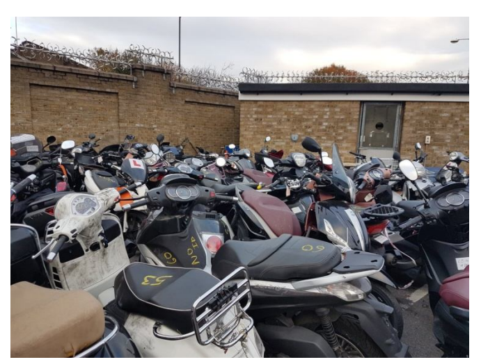
Just some of the stolen mopeds we have recovered.

It is widely believed that we cannot pursue, when in fact we can and do. Yes, there are restrictions and officers must be properly trained in pursuit tactics but the pursuit policy is clear. Where there is sufficient justification