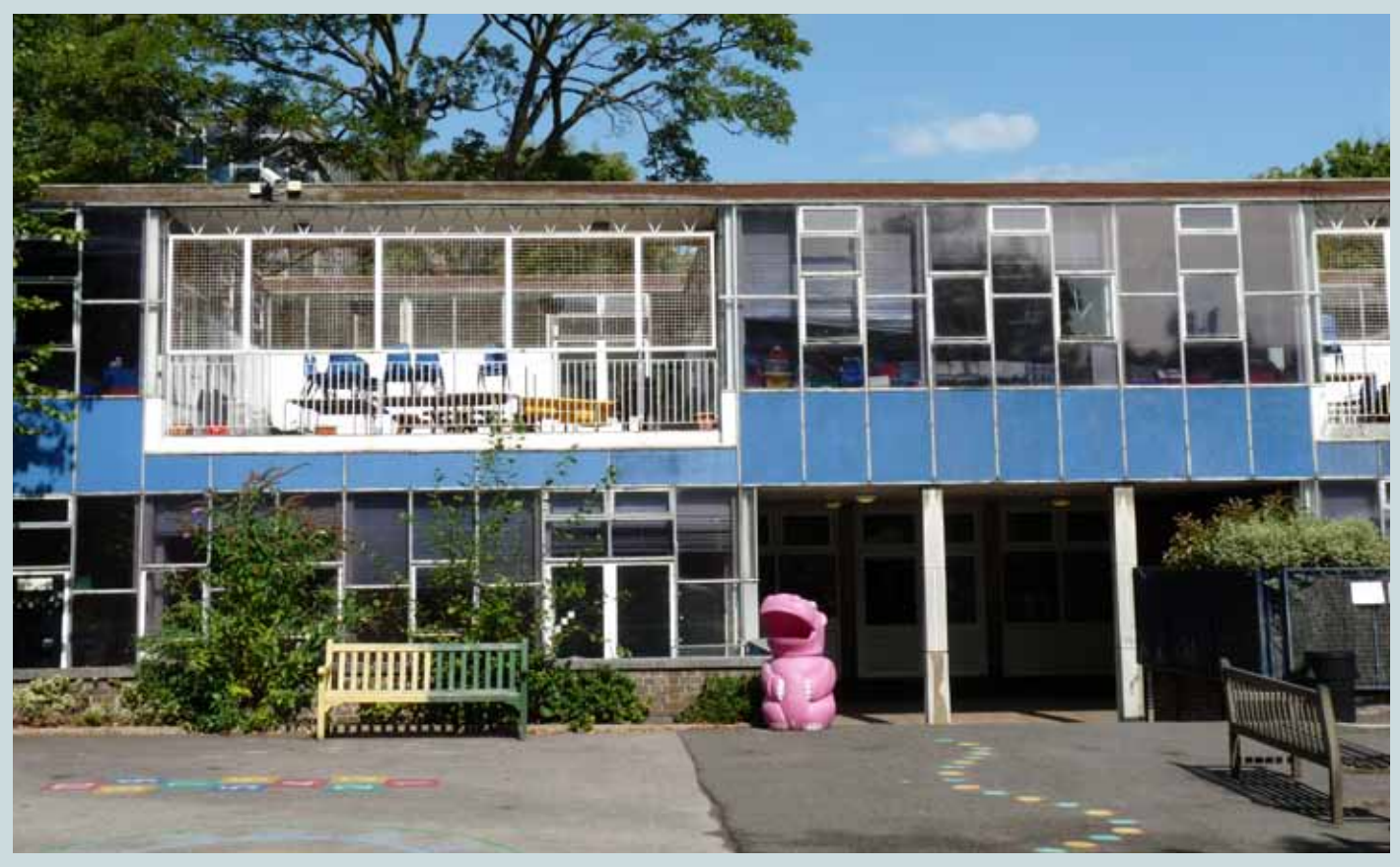
The rear of the school viewed from the existing playground